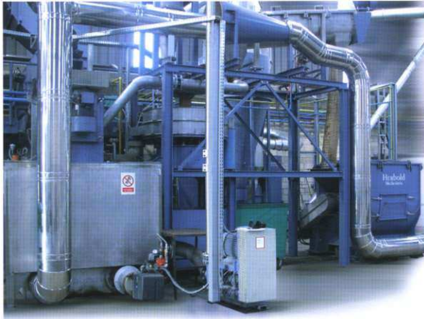
Hot Wash Step