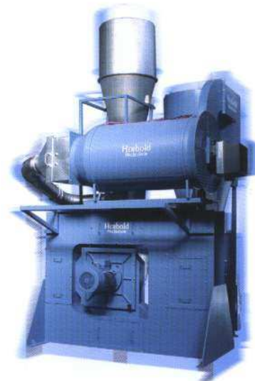
Hot Air Dryer