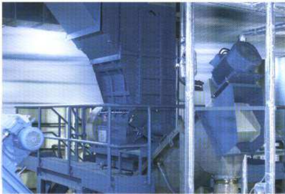
Washing Mill with Friction Washer